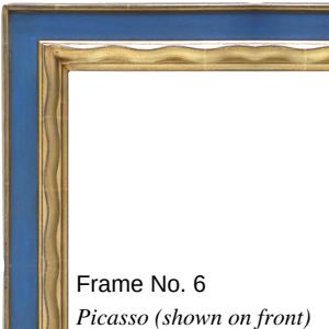
Frame No. 6 Picasso (shown on front)

www.fattorifineframes.com | (561) 379-2601 | paul@fattorifineframes.com