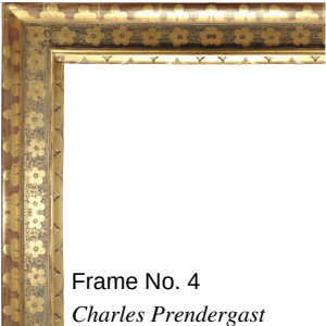
Frame No. 4 Charles Prendergast