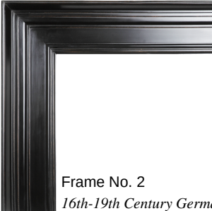
Frame No. 2 16th-19th Century German