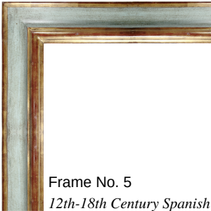
Frame No. 5 12th-18th Century Spanish